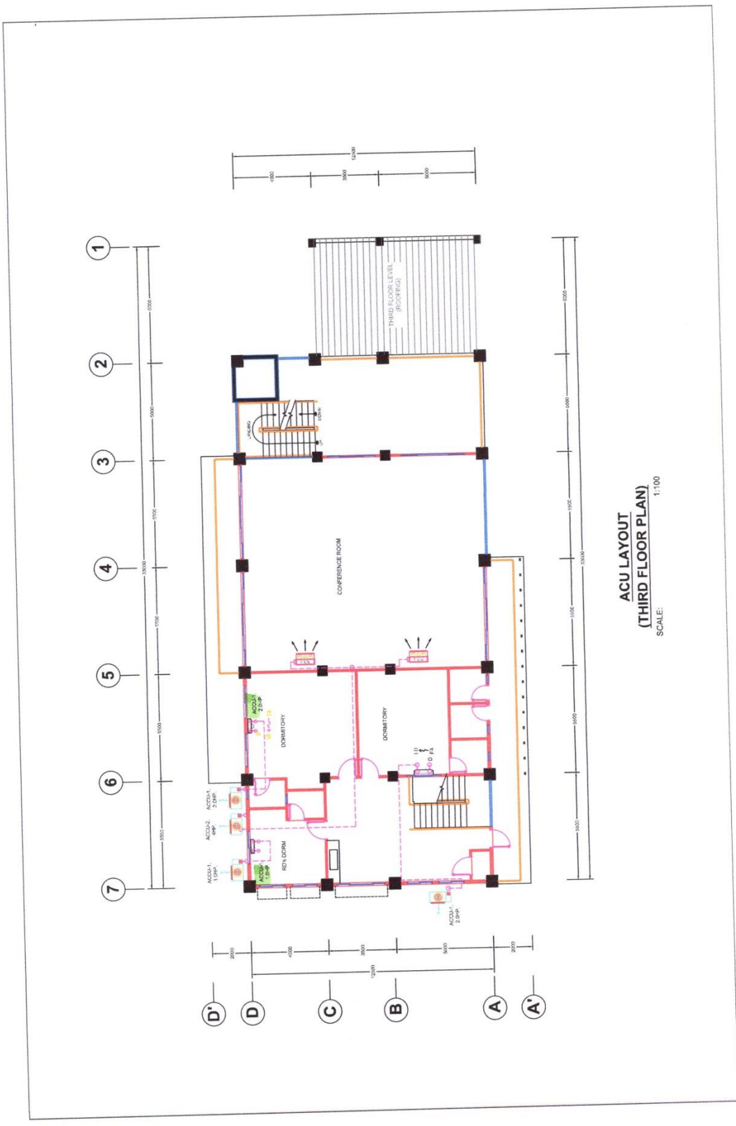
ACU LAYOUT (THIRD FLOOR PLAN) SCALE: 1:100