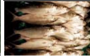
Pangasinan is noted for its bonuan bangus (milkfish) which is commercially cultured and produced not only in Dagupan City but also in other municipalities along Lingayen Gulf.

New Urduja Hotel , Poblacion, Urdaneta City; Star Plaza Hotel on AB Fernandez Avenue; and Lingayen Gulf Resort Hotel in Lingayen. All offer first class amenities that include airconditioned rooms, coffee shops, restaurants, and function rooms. In Urdaneta City, the Lisland Rainforest Resort beckons with its swimming pool, picnic huts, and dancing hall. Other places ideal for rest and recreation are the Pangasinan Village Inn in Calasiao, the San Fabian Resort and Beach Club , Sierra Vista Beach Resort in San Fabian, and the Villa Jireh Resort in Labrador.