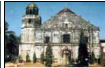
Centuries-old church in Bolinao.