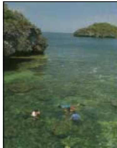
Scuba divers enjoying the clear waters at Hundred Islands.