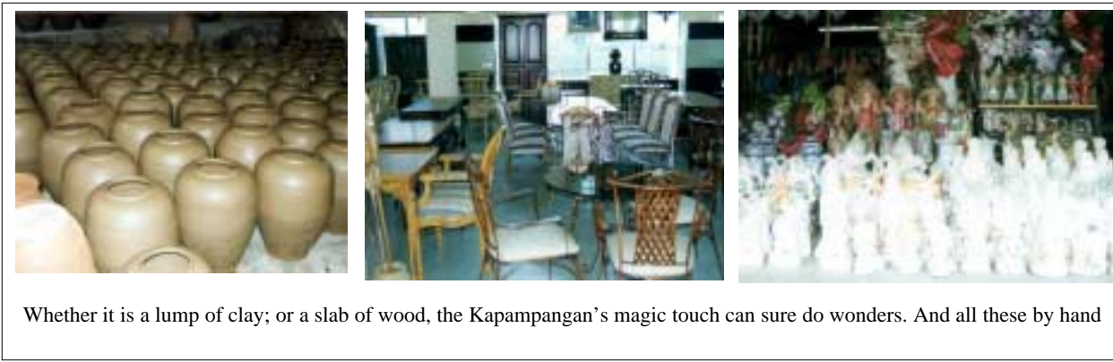
Whether it is a lump of clay; or a slab of wood, the Kapampangan’s magic touch can sure do wonders. And all these by hand

Among Pamapnga’s pride are its places of interest and historical landmarks. These are: