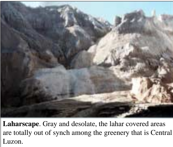
Laharscape. Gray and desolate, the lahar covered areas are totally out of synch among the greenery that is Central Luzon.