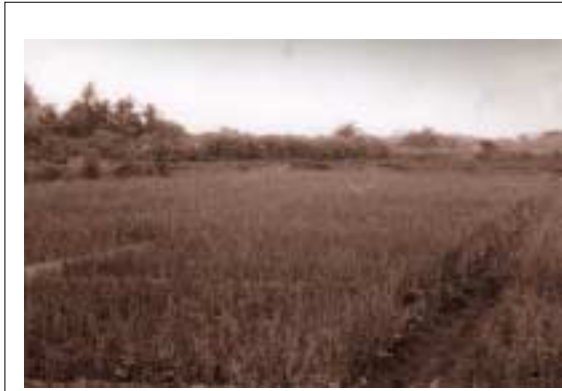
Onion growing in Bongabon, Laur, Palayan City and nearby towns establishes Nueva Ecija as the onion-basket of the Philippines.