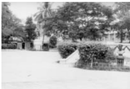
Plaza Lucero is the site where Gen. Antonio Luna of the revolutionary government was assassinated.

There are 104 concrete and two temporary bridges with a total length of 4,500 kilometers.