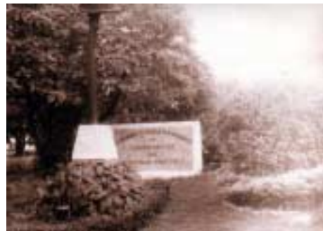
The historical Freedom Park which include the shrine of the unnamed soldiers and heroes.

The main industries in Nueva Ecija are as follows: wood and other forest products processing, paper manufacturing, construction materials, mushroom culture and processing, livestock and poultry production, cattle breeding/fattening, and dairy production. Other industries are swine breeding/fattening, broiler production, egg production, inland fisheries, agro-processing, onion dehydration, cucumber pickling/relishing, citrus fruit juices, mango juice, tomato paste and juice, garlic, sericulture, seed production, organic fertilizer production, sack manufacturing, bran oil processing, export industry for handicrafts, trading services, agro-based enterprises, and other manufacturing industries like furniture making, construction materials, and metalcraft.