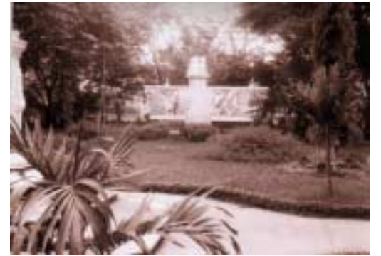
The Pangatian Memorial Park marks the site where American prisoners of war were freed by the Novo Ecijano soldiers from their Japanese captors.

There are many transportation facilities in the area. The Baliwag Transit Inc. , Five Star