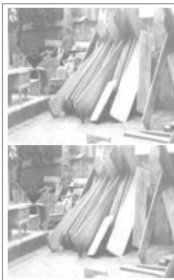
One of the industries in the province is furniture-making using narra as raw materials.

Ilagan, Roxas, Santiago City, and Cauayan have been identified as primary investment centers, while