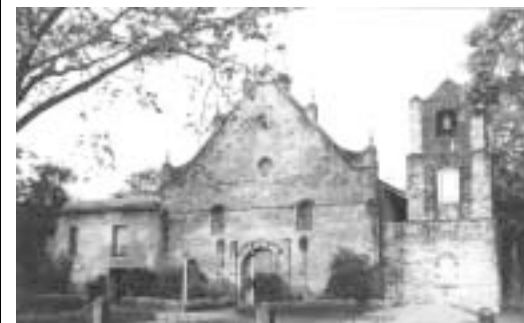
The St. Rose of Lima Parish Church in Gamu.

There are various interesting tourist spots in Isabela, like the Guibang Church which houses the Our Lady of Visitacion (in Gamu), Dibulo Waterfalls , Bonsai Forest (in Dinapigue), Honeymoon Island , White Sand Beach (in Divilacan), Masadamian Waterfalls and San Miguel Caves (in Echague), Sta. Victoria Caves and Fuyo Spring (in