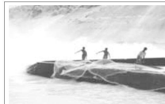
The 540-megawatt Magat Dam supplies electricity to the whole of Region II and other parts of the country, and also serves as a fishing ground for some Isabelinos.

Other transport companies are: Mary Ann Lines , and REM Liner with terminals at Barangay Villasis.