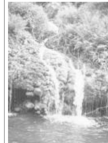
The cool refreshing waters of the Dibulo Falls in Dinapigui.

Ilagan), Aguinaldo Shrine , Digoyo Point , White Sand Beach (in Palanan), Antiquated Spanish Church (in San Pablo), Cylindrical Church Belfry (in Tumauini), and the Magat Hydro-Electric Plant (in Ramon).