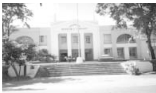
The Isabela Museum and Library houses the memorabilia of the province.

out the year. The western part has a pronounced wet and dry season.