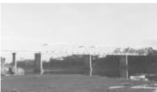
The Upi-Gamu Bridge is the longest bridge in the province.

Isabela has a thousand kilometers of provincial and national road networks, with 8,699 lineal meters of mostly permanent bridges interweaving across the province. The Maharlika Highway is the major route to and from the region.