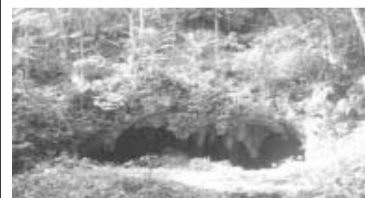
The entrance of Victoria Cave, one of several caves in the province with underground waterfalls and naturally-formed lattices and shining rocks.

Cabagan, Alicia, Palanan, Echague, and Aurora as secondary growth centers.