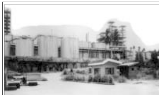
The Primo Oleochemicals, Inc., one of the major industries in the province.

making and buri-weaving are two of the more important cottage industries.