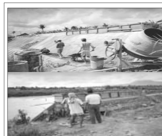
The Labo River Control structure undergoing repair and maintenance.

Philippine Airlines has flights to Daet every Tuesday and Thursday. Asian Spirit and light