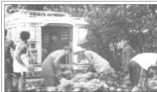
Farmers loading their produce, the famous formosa pineapple, to be marketed.

Although the province is predominantly agricultural, it has rich mining areas with abundant reserves of gold, iron, copper, uranium, lead, and zinc not to mention a thriving fishing industry. Hammock-