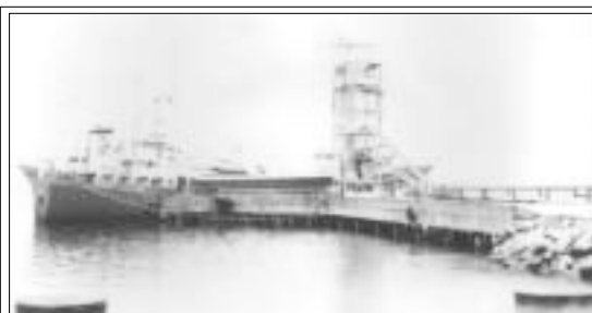
A private international seaport at barangay Osmeña, Jose Panganiban town.